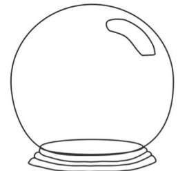
HAZ UNA PREDICCIÓN (make a prediction)