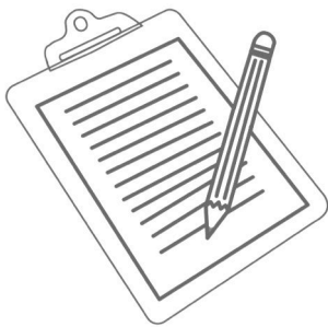
REVISA LOS RESULTADOS (review results)

Put the problem solving steps in order. Color each image.